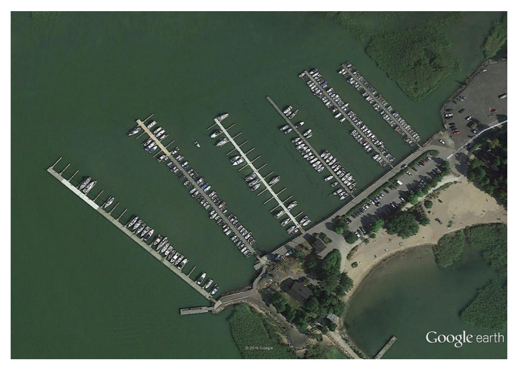
Figure 2: An example of satellite imagery used to calculate the number of boat places in a small boat marina (Soukka/Espoo, Finland).

A list of pleasure craft harbours (boat place counts, location) for each riparian state was collected based on survey data, existing national studies and satellite image analysis (see Figure ). Then, a new simulation model for the geographical distribution of pleasure boat activities was built specifically for the SHEBA project (the new simulation model works as an extension to FMI-STEAM).